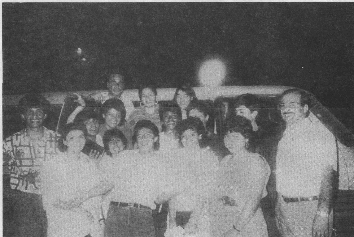
Big smiles and gestures of appreciation from the young people at Amistad Christiana. We want to thank all of you who had a part in helping to secure transportation and equipment for evangelism.