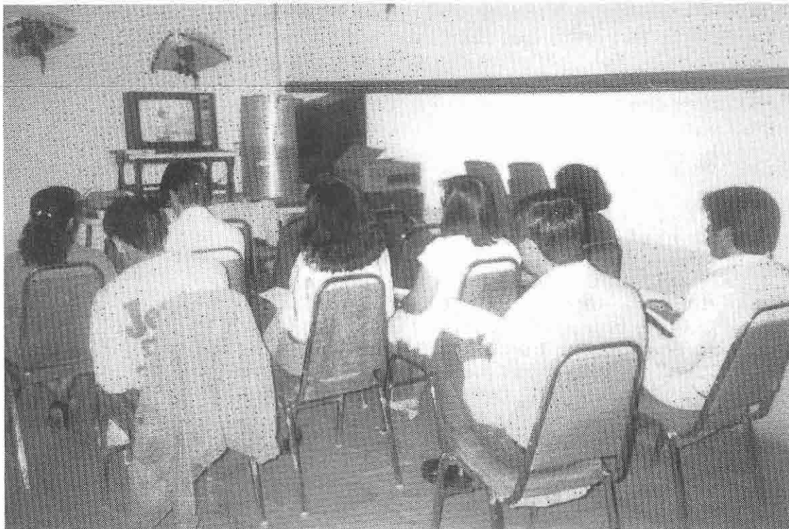
The Video Bible School in Tabachines, Jalisco.