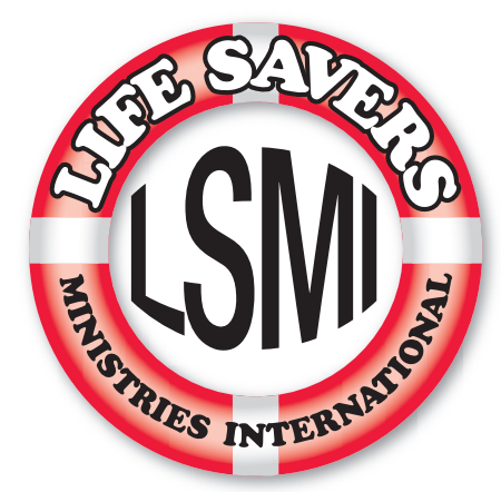
A.K.A. Lee Short Ministries International