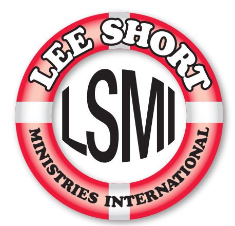
A.K.A. Vida Internacional