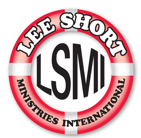
A.K.A. Vida Internacional